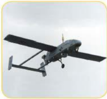
UAV Flight Control